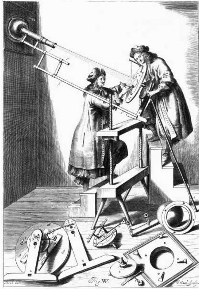
Figure 2.1: Astronomers observing a solar eclipse. The image of the sun is projected upon a screen and the limit of the obscured portion carefully recorded. From Hevelius's Machina Coelestis